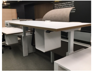
BENCH ELECTRIC Model: INBELAK