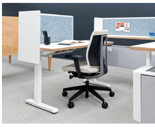
FREESTANDING ELECTRIC Model: INKAL