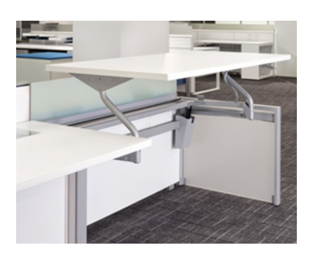
BENCH/SYSTEM MANUAL Model: INBEZ