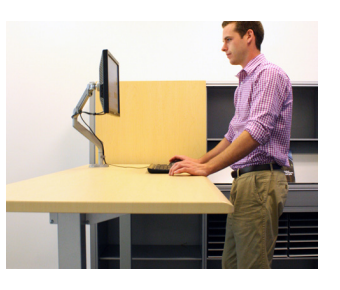
FREESTANDING MANUAL MODEL: INSSWS/EGFTCB

Improve your comfort, health and productivity with our selection of height adjustable worksurfaces. Our collection offers greater height range and lifting capacity with a smooth and quiet pneumatic or electric mechanism.